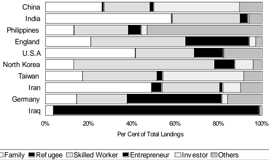
Table 4: B.C. Immigrant Landings by Source By Class, April - June, 2009